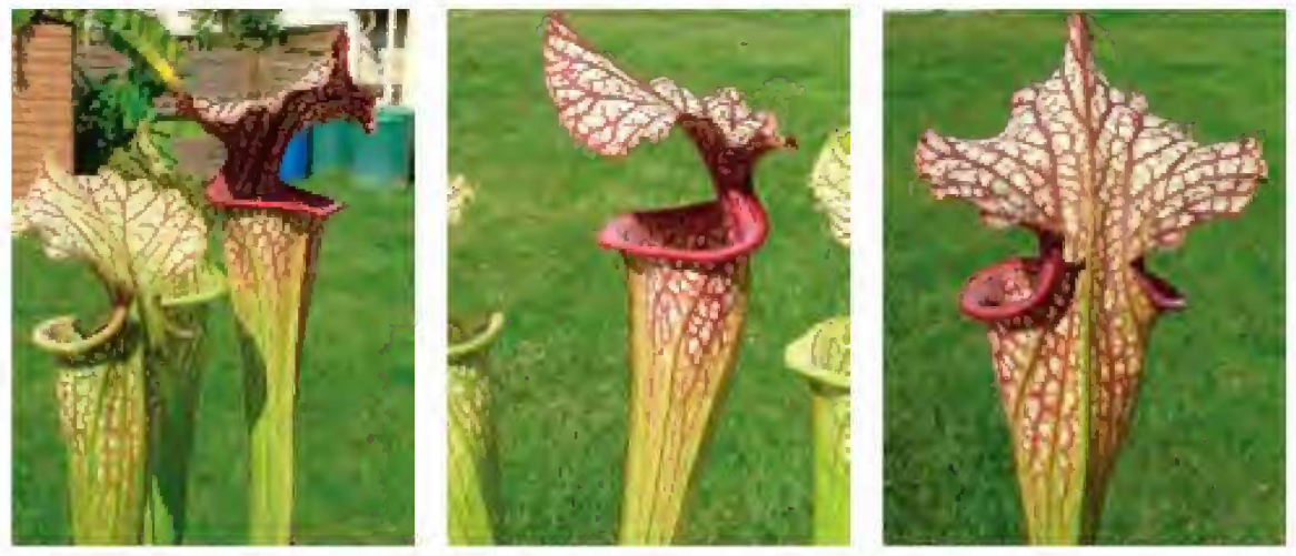
Figure 4: Sarracenia 'French Kiss' pitchers.

Vegetative propagation is necessary to maintain the unique features of this hybrid.